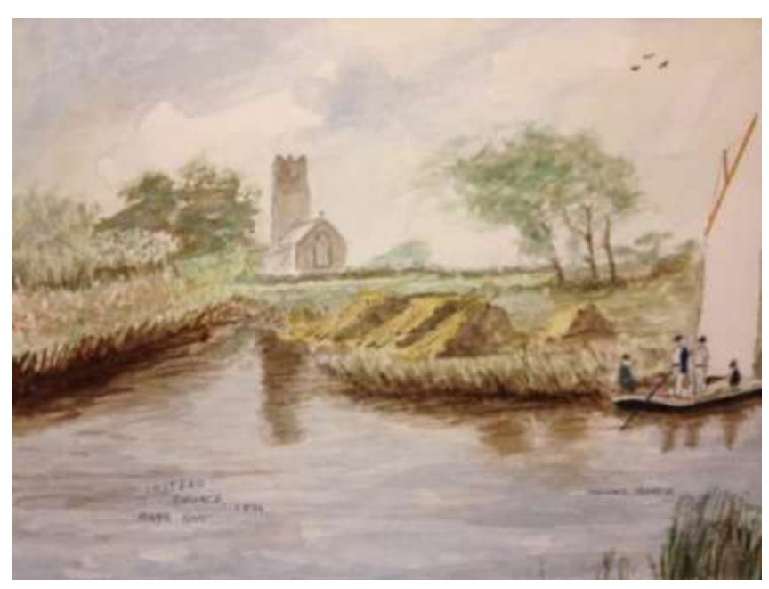
Irstead Staithe and Church, circa 1890