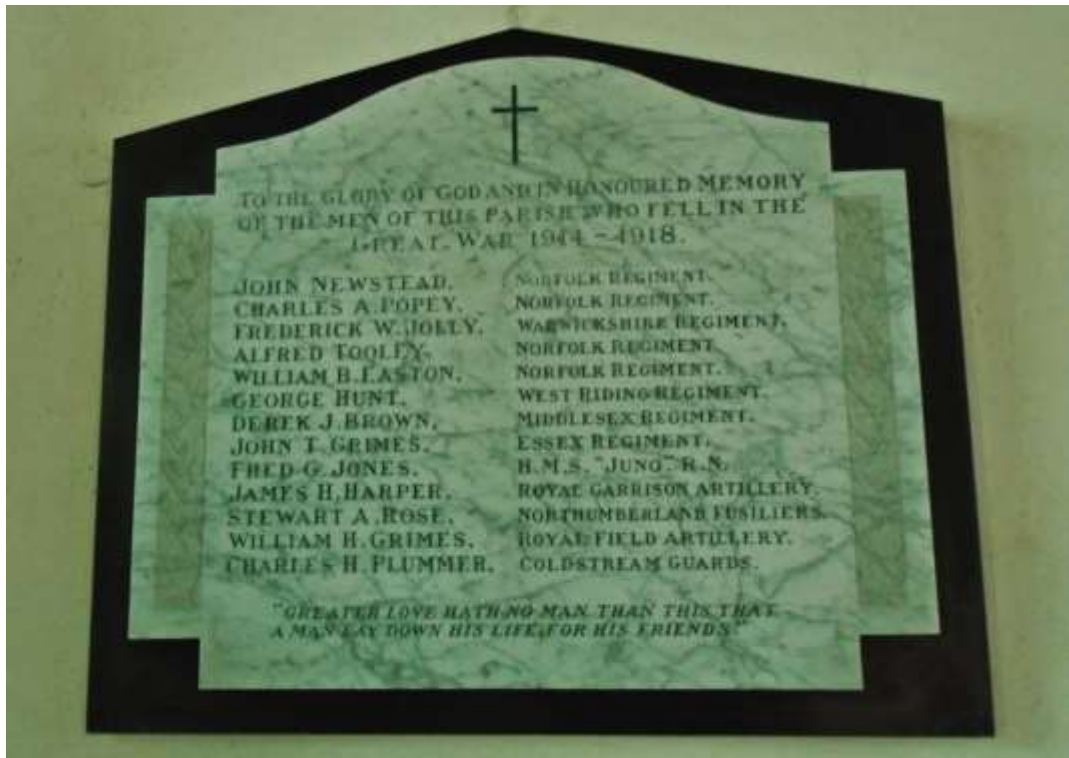
Memorial in St Peter's Church, Neatishead

Born: c.1887 in Witton, near Blofield, Norfolk