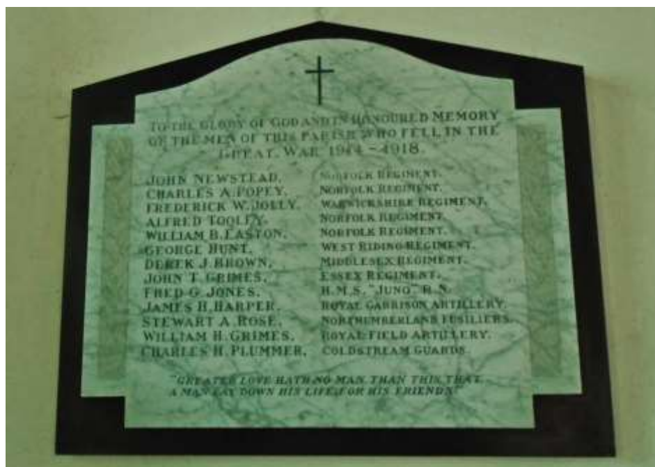
Memorial in St Peter's Church, Neatishead

Born: 19 th February 1890 in Neatishead, Norfolk